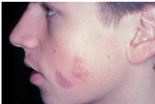
Figure 4 Port wine stain before treatment with FLPDL.

The near-infrared 1064 nm Nd:YAG laser is also utilized for vascular lesion treatment. This wavelength is not as well absorbed by hemoglobin as the previously discussed