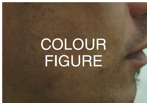
Figure 2. More than 75% improvement in acne scars 12 months after treatment.