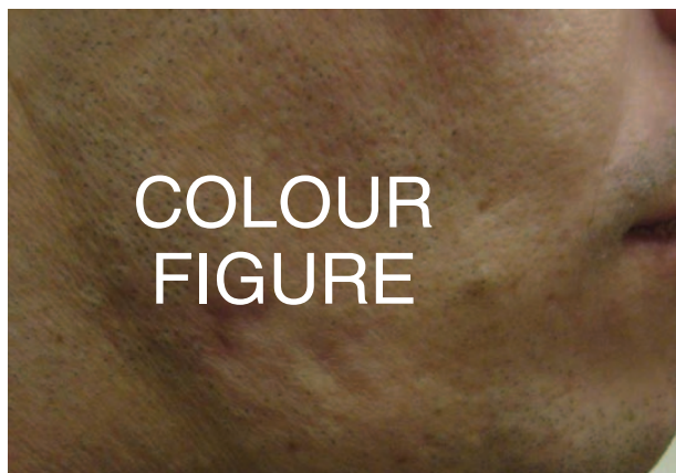
Figure 1. Saucerized acne scars before treatment.

Total volumes used ranged from 0.1 to 0.3 ml CaHA per treatment. At the 12-month evaluation, three subjects showed >75% improvement; six subjects showed between 50% and 75% improvement, and one subject showed between 25% and 50% improvement in treated saucerized scars (Figures 1 and 2). No subjects showed any improvement in their ice-pick scars (Figures 3 and 4). One subject showed some persistent erythema at one treated site at the 1-month evaluation. This was resolved by the 2-month visit. Extrusion at the injection site was noted in four subjects. Three subjects received a